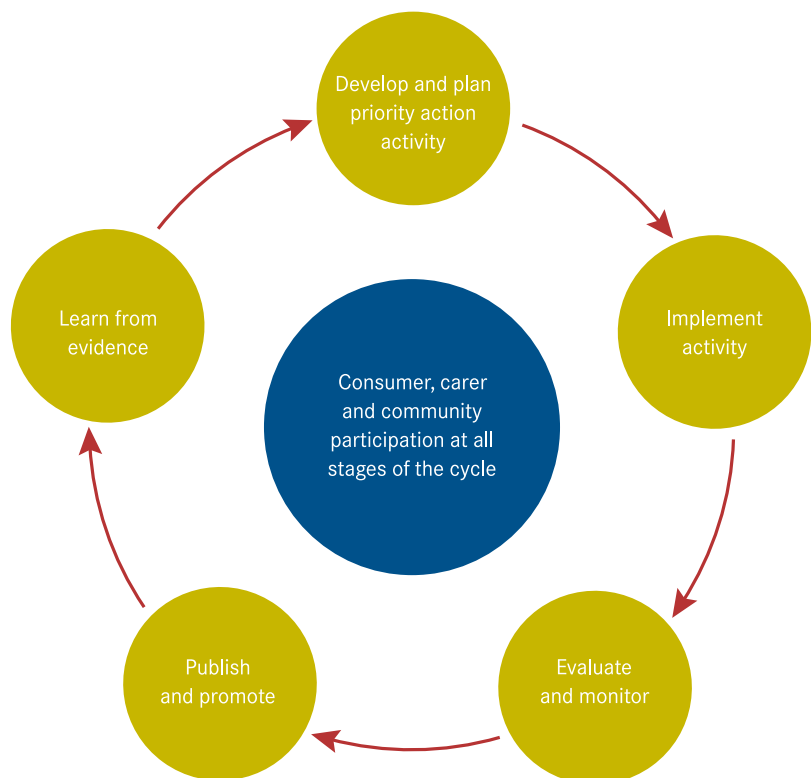
Figure 1 Participation evaluation and monitoring cycle

Through project funding guidelines and service agreements, health services and community organisations will be encouraged to conduct evaluation of participation. Evaluations should reflect the priority actions and the participation evaluation and monitoring cycle described in Figure 1.